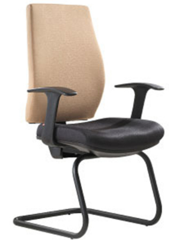
U4H-NH1-M21B57-73A-R2 PRESIDENTIAL HIGH BACK SYNCHRON CHAIR

H 1170-1270 W 635 D 640 SH 430-530 SW 490 SD 485 BW 660